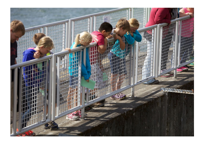
Children watch salmon at Spring Creek Fish Hatchery

Preventing overharvest of commercial and recreational fisheries is key to rebuilding critically low stocks and meeting the state's co-management responsibilities with Washington tribes. Inslee's budget creates a robust monitoring program to ensure recreational and commercial salmon and steelhead harvests are within permit limits. This would also demonstrate accountability on the state's share of salmon harvest and ramp up enforcement and prosecution of fisheries crimes.