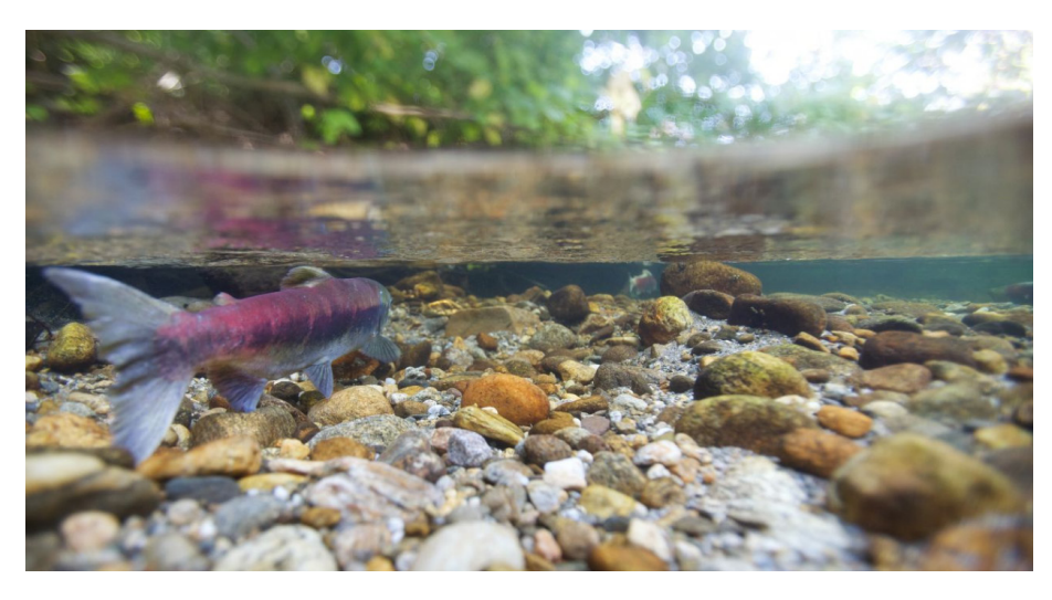
Sockeye salmon spawn in the Little Wenatchee River near Leavenworth, Washington.

The governor now proposes the strongest suite of budget and policy initiatives in Washington's history to help protect and restore vital salmon