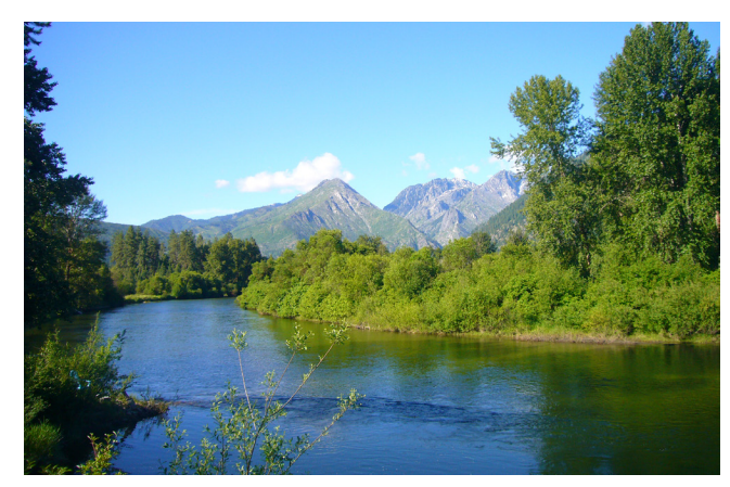
Riparian salmon habitat along Icicle Creek near Leavenworth.

• Fish passage maintenance team: Fishways and fish screens are required to provide safe passage for migrating fish. Hundreds of state, federal, and