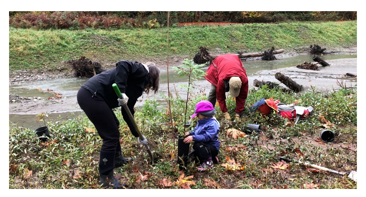
Volunteers plant trees alongside streams in the Skagit River watershed. Trees are a critical part of the ecosystem, shading the river and keeping it cool for fish.

Watershed Resilience Action Plan for Snohomish (Department of Natural Resources) – Fund the Snohomish watershed-scale salmon recovery plan. This includes kelp and eelgrass monitoring, large woody material installations, and fish passage barrier surveys and outreach. ($2.8 million Natural Climate Solutions Account)